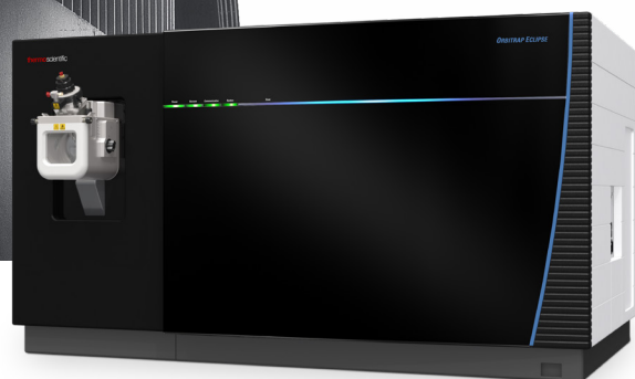
Orbitrap Eclipse Tribrid Mass Spectrometer